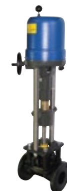
Electrically actuated valves