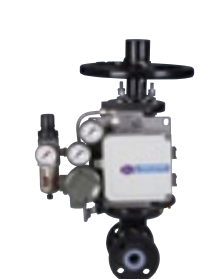
Diaphragm control valves