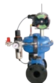
Actuated diaphragm Valves