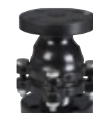
Flap Check Valve