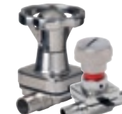
High Purity Diaphragm Valves