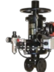
Actuated diaphragm valve