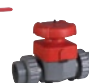
Plastic Valve Systems