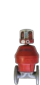
Weir Type compact actuation systems