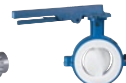
PTFE Lined Valves