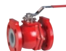
PFA Lined Ball Valves